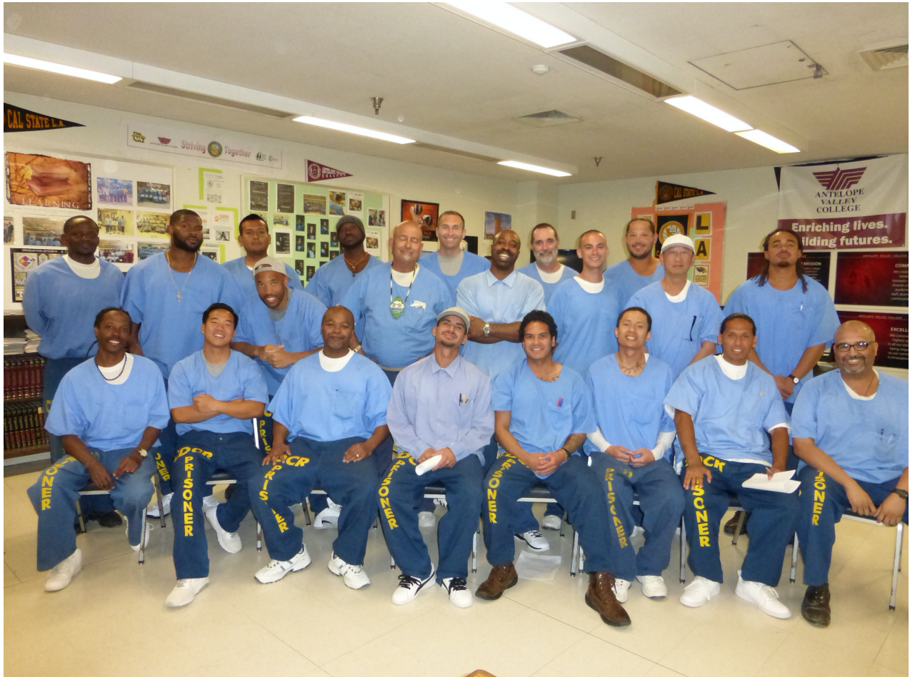
A class photo of Cal State LA communication studies BA students (second cohort) in Lancaster Prison.